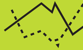
FIGURE 2: SPEND ON DOMESTIC OVERNIGHT TRIPS BY ITEM OF SPEND